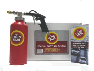
Pro Gun U/Coat Spray Kit