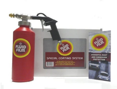
Pro Gun U/Coat Spray Kit