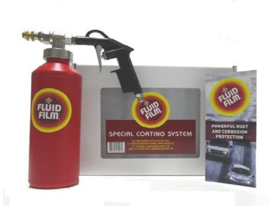
Pro Gun U/Coat Spray Kit