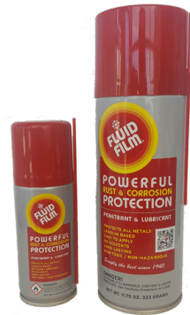
Fluid Film AS (Grade 2)