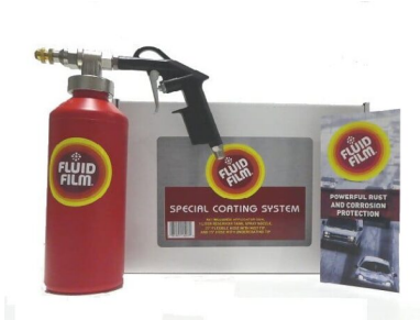
Pro Gun U/Coat Spray Kit